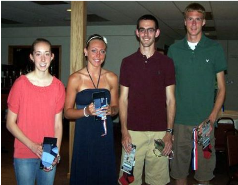
2009 Scholarship Winners